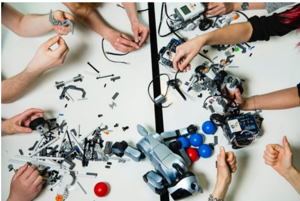
In our courses, students can work with programming Lego robots.

With the coming of the Big Wheel programme, there will be some extensive changes to the teaching arrangements, as the teaching becomes the responsibility of separate education programmes. Students who have been admitted earlier can, if they so wish, continue in accordance with the old system during a transit period up until 31 July 2020.