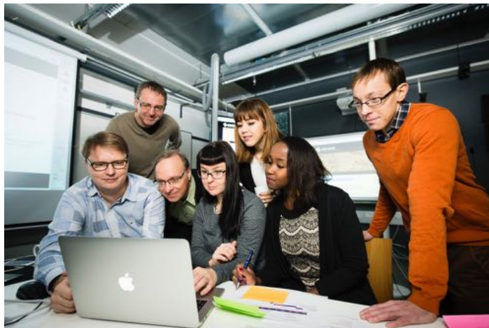
Members of the ESE group.

Home page: https://www.cs.helsinki.fi/group/ese/