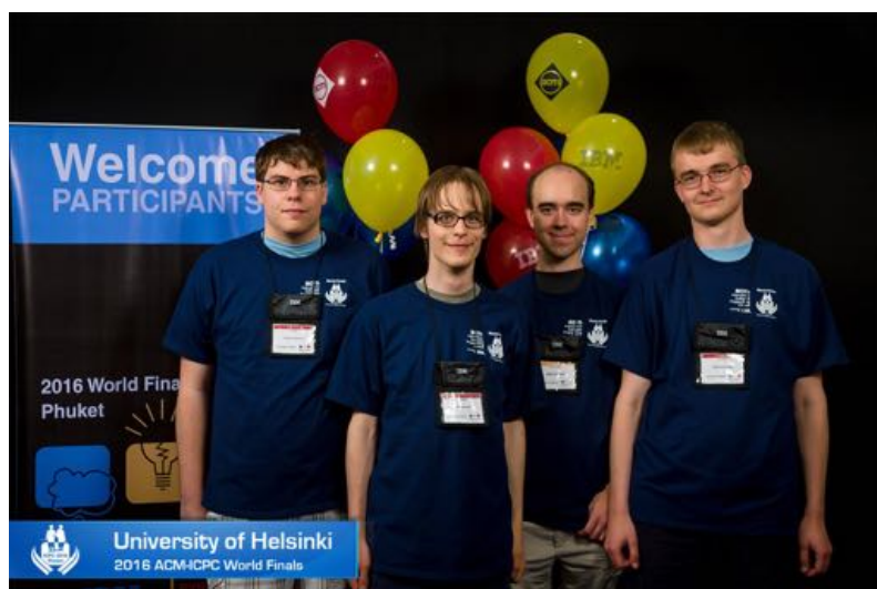
Game of Nolife, the competitive programming team of the department in the finals of the ICPC competition.