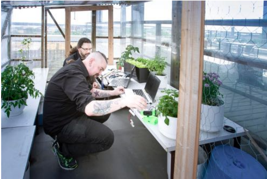
The greenhouse on the roof of Exactum is used both in teaching and research.