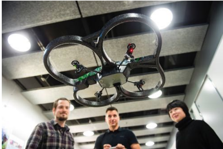
Researchers from the ICL group.